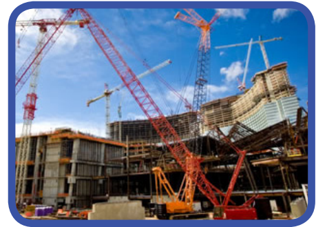
Figure 1: Cost to correct a specification error or conflict